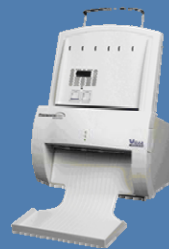
Digital Scanners by VIDAR The Leader in Digital Scanners

StudyArch is a revolutionary external patient study management and archive tool. Space efficient, user friendly, flexible and Lifetime Warranty! No IT resources needed!